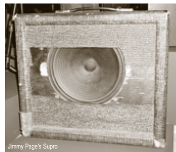
Jimmy Page's Supro

amplifiers and guitars excel at fulfilling very specific roles within a finite range of musical styles. Used appropriately, these instruments perform brilliantly, but when their true purpose (intended or accidental) fails to be considered and carefully explored, the potential for discovery on the scale of our experience with the Brentwood can be completely lost. The rigid, mythical consensus view held by the masses as to what constitutes the most desirable guitars and amps is not only horribly flawed – their lack of creative thought and blind allegiance to conventional “wisdom” imposes the artificial illusion of a dead